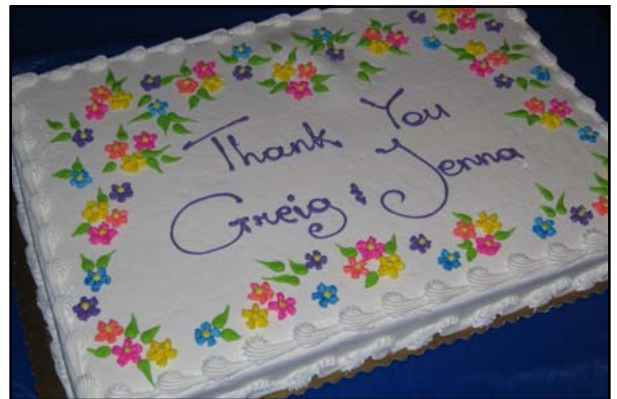
After friday nights worship, there was a time of fellowship with cake and drinks.