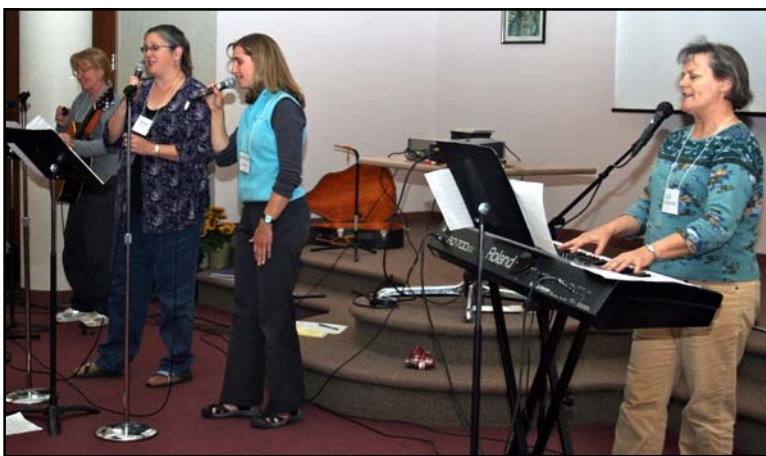
Worship happened before each session and on Sunday.