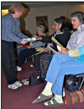
Bohemian Love Feast, an early Christian worship experience.