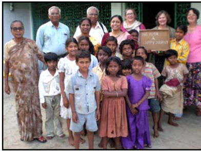
At the orphanage

Prior to the trip, children's books, clothes, sweaters, school supplies, soaps, shampoo, candies and cookies were donated by Corona church. In every place we went to minister, we were able