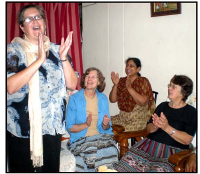
Songs of joy

God answered our prayers. We did more than we planned to do during this trip. Even though there were distur-